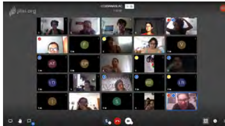
Screenshot of a virtual meeting held on Saturday, April 26, 2020

As of now, the five organisations comprising LESLAC's Coordinating Group are Ecuador's Mujer y Mujer Foundation, Bolivia's Network of Lesbian and Bisexual Women, Colombia's Corporación Femm, Mexico's AC Musas de Metal, and Peru's Socialist Feminist Independent Lesbians (LIFS). We reaffirm ourselves as LESLAC - Network of Lesbian and Bisexual Women's Organisations of Latin America and the Caribbean - and our purpose is to creating spaces for reflection, dialogue, and work to coordinate actions that address the effects of public and private discrimination and violence against lesbians, bisexual women, adolescents, youth, adult and older adult women in Latin America and the Caribbean. We work towards making LESLAC an articulated and renowned feminist network, with the ability to influence and manage regional public policies, and to drive and strengthen lesbian activism in LAC.