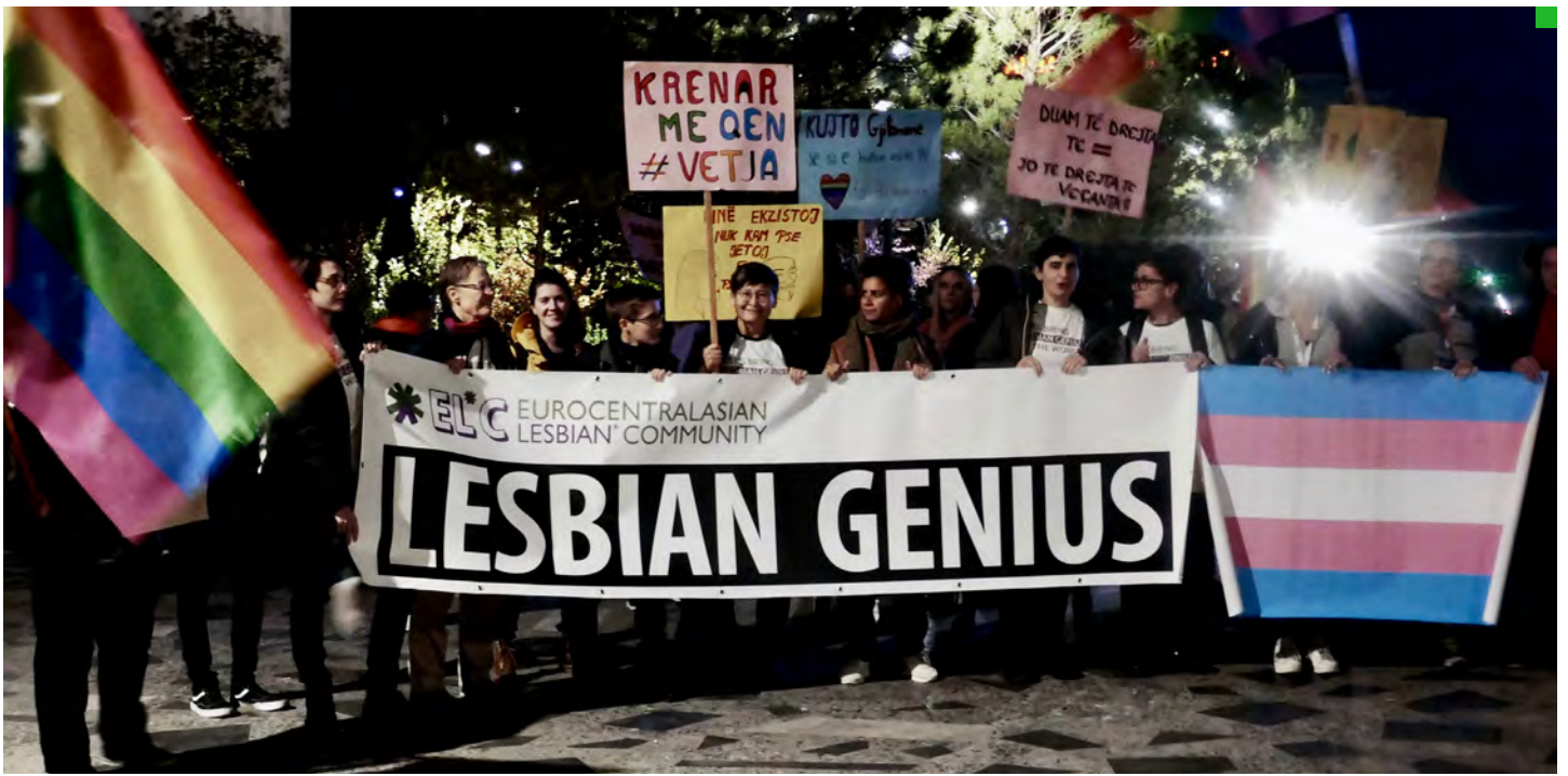
Photo: Leila Lohman, Tirana (Albania)'s first lesbian march (2019)

than half a dozen persons working full-time focusing on: events, advocacy, development, administration, community and communications among other areas. And yet, the stakes have never been higher! With extra power comes extra responsibility and scrutiny, and the political dynamics in the region are ever changing.