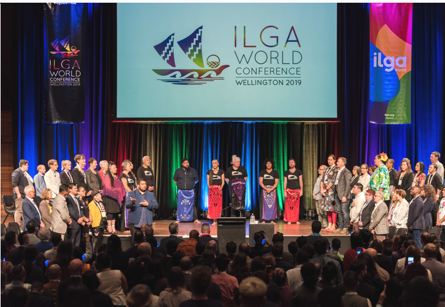
A plenary session during the 2019 ILGA World Conference

ILGA World is the International Lesbian, Gay, Bisexual, Trans and Intersex Association.